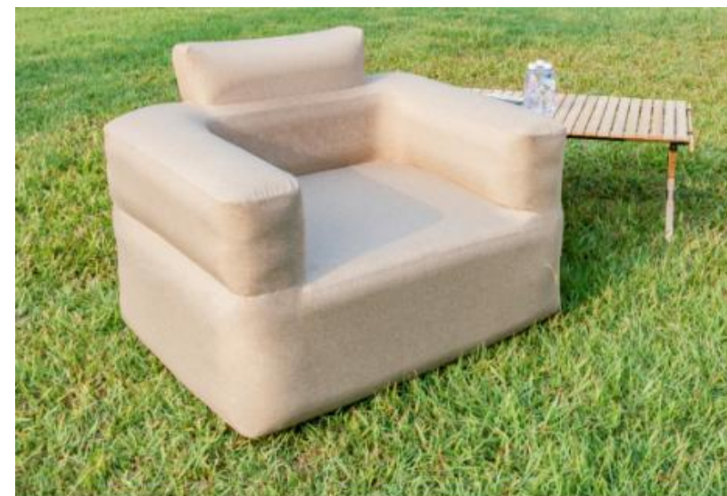
AIR BED & AIR SOFA